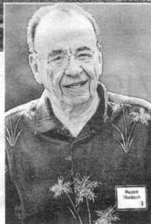
BLOOMBERG NEWS PHOTO, 2007

Rupert Murdoch's house on Centre Island, Rosehearty, has been taken off the market.