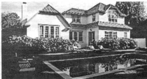
A home for sale on Captain's Row in Sag Harbor

The 11-bedroom, 7½-bath manse was last offered at $12.8 million.